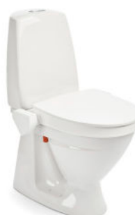
My-Loo 6 cm