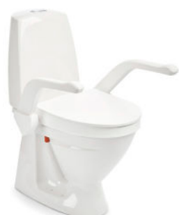
My-Loo with armrests 6 cm