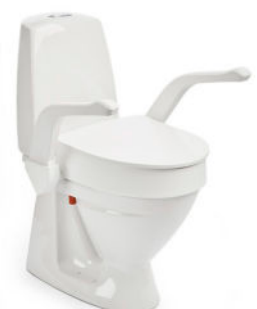
My-Loo with armrests 10 cm