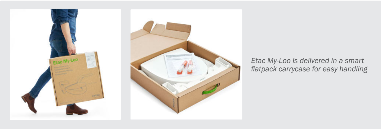
Etac My-Loo is delivered in a smart flatpack carrycase for easy handling