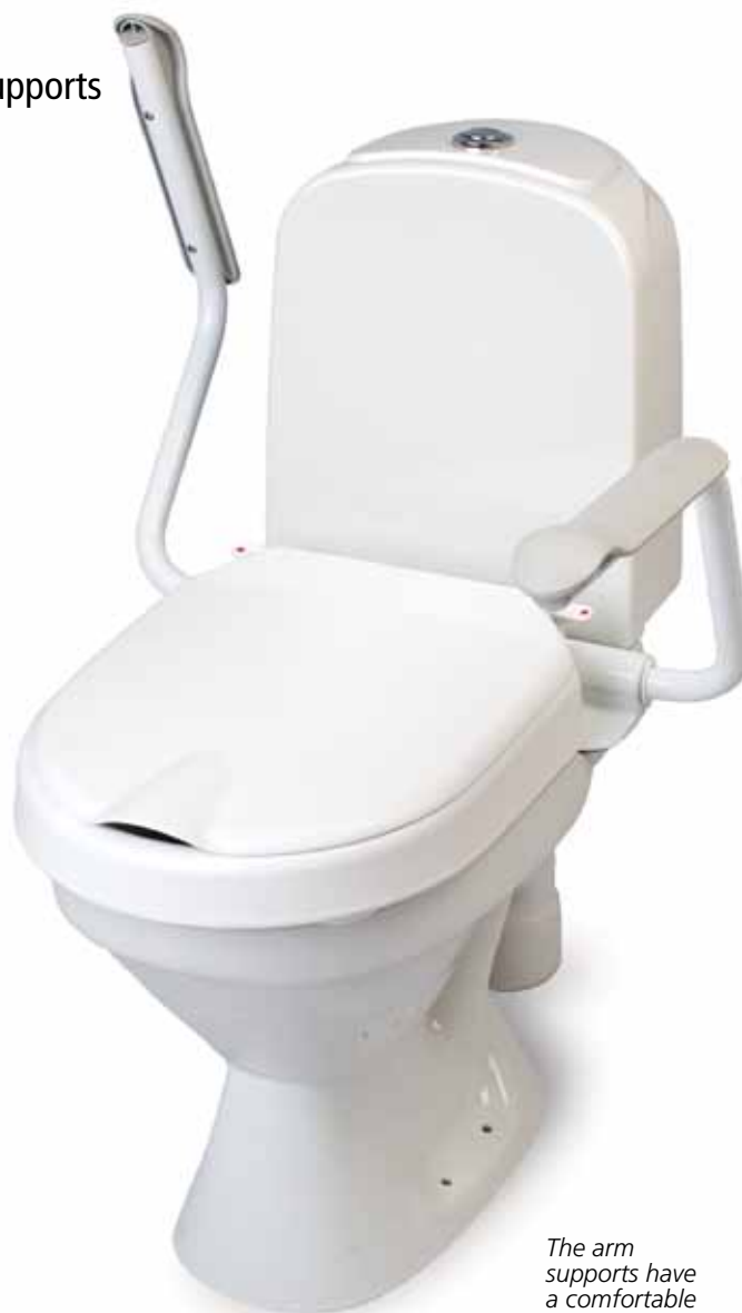
The arm supports have a comfortable rounded grip.

Hi-Loo can be fitted on most toilets and stays securely in place. The raiser has two large friction elements which gives a firm contact with the toilet. If extra stability is required for sideways transfers, the friction elements can be exchanged for brackets. The arm supports are detachable. If space around the toilet is limited, Hi-Loo can be used with only one arm support. Hi-Loo is designed to fit both floor and wall mounted toilets and no tools are required for mounting.